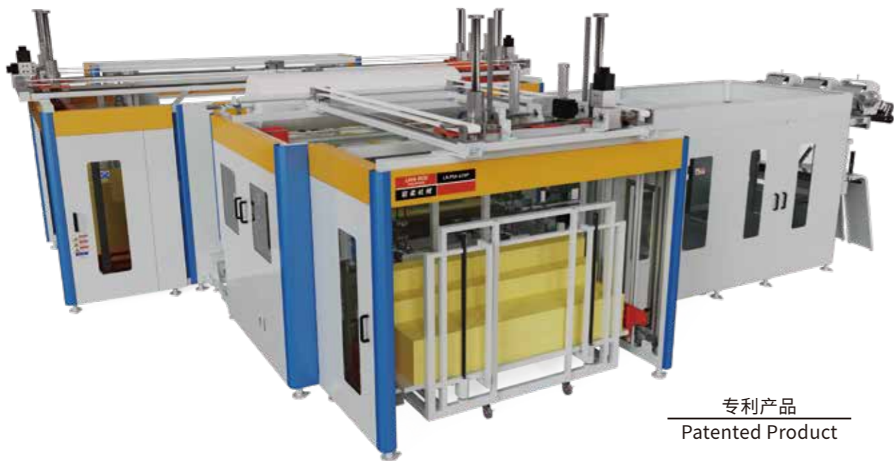
专利产品 Patented Product